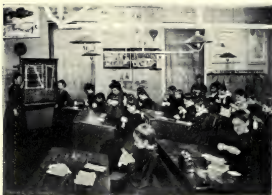
Fig. 28. SEWING CLASS.

The teaching staff includes the headmaster, who does not take any particular class, and ten masters and mistresses holding various certificates, besides the sewing mistresses, singing masters, drawing masters,